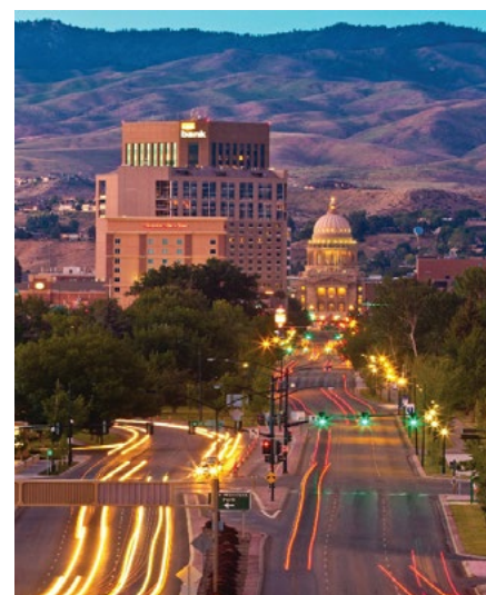
An agriculture tour...

The Boise Airport is served by six airlines and is only minutes from downtown.