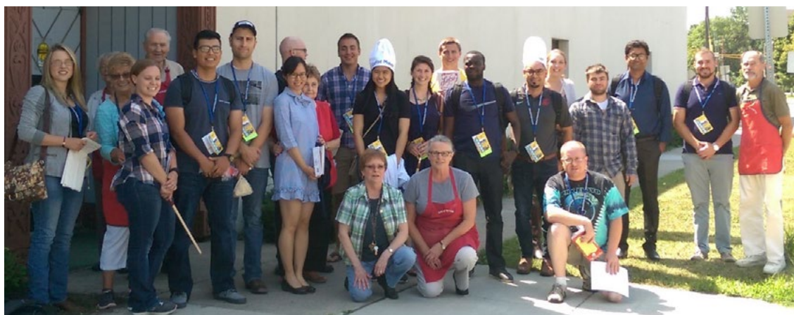
Graduate students got a taste of Norwegian culture by learning to make lefse. Members of the Sons of Norway Lodge provided the expertise needed for making these super thin potato pancakes.